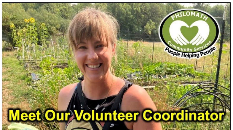
Meet Our Volunteer Coordinator