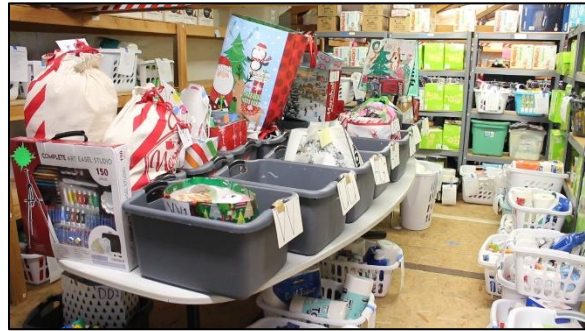
Holiday Cheer Gift Organization