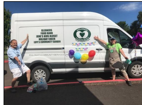
PCS at the 2022 Frolic & Rodeo Parade