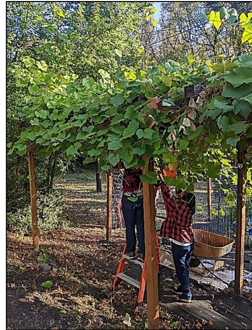
Gleaners Picking Grapes