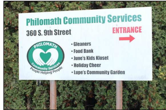
All Are Welcome!

One thing that remains constant is the inspiring generosity of our neighbors. All of the metrics detailed below are made possible thanks to our big-hearted community—thanks to People Helping People .