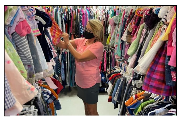
Volunteer Organizes Clothing for PCS