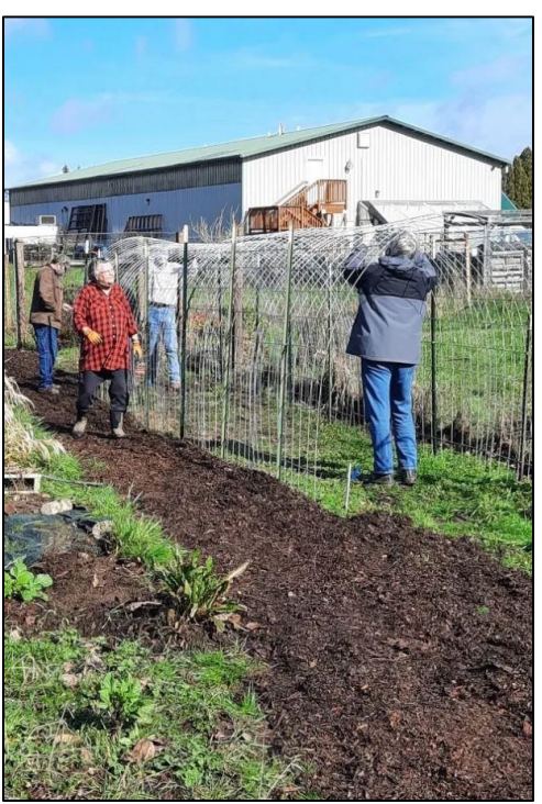
Volunteers at Work in Front of PCS