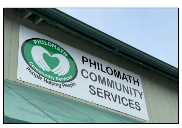
PCS Building Sign—All Welcome!

Please read on for details, and thank you for your support of this essential charitable organization.