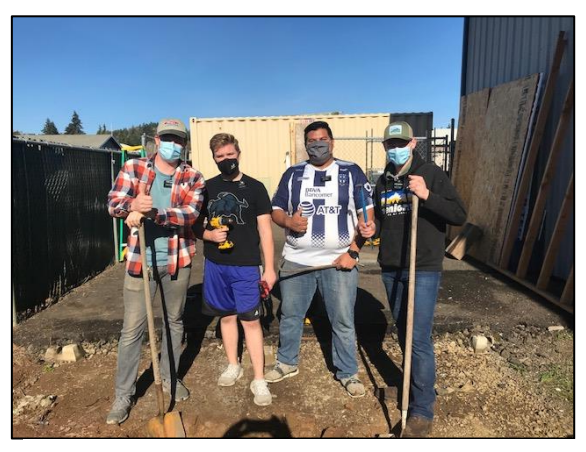
Latter-day Saints Volunteering for PCS