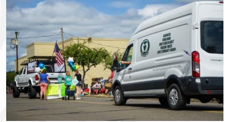
PCS in 2019 Philomath Frolic Parade