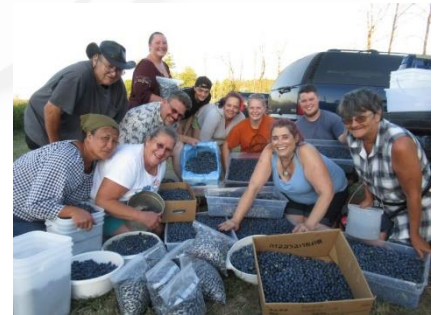
2019 Blueberry Glean

Thank you so much to the citizens of our community!