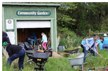
2019 Garden Work Party